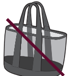
OVERSIZED TOTE BAG